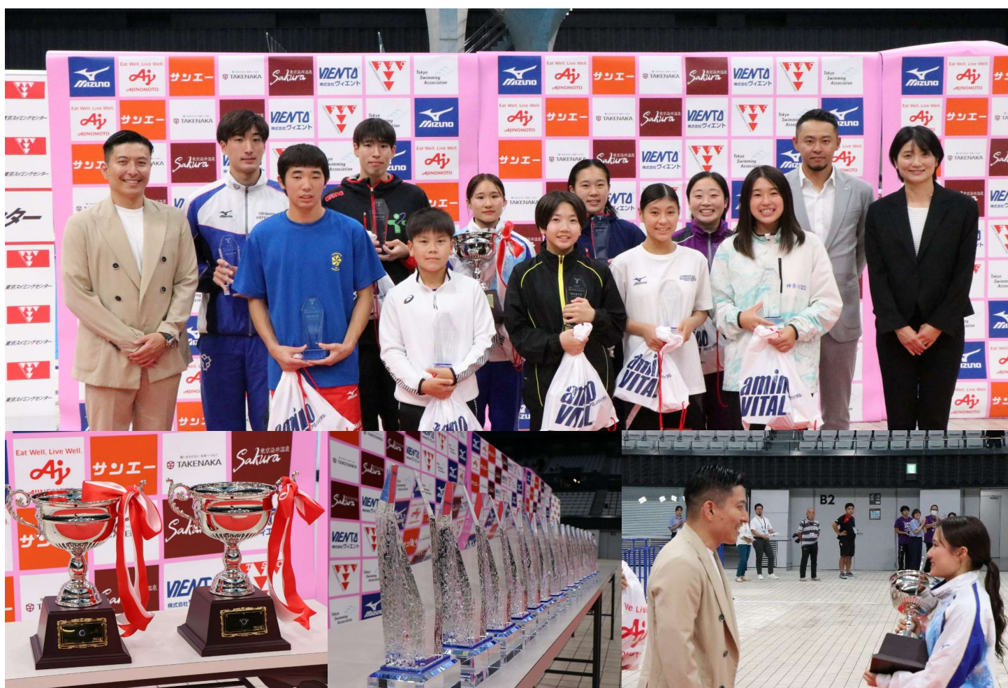
Best Award Swim & Dive

Best Award will be selected to one diver from Championships regardless the gender and Junior Best Award from each F/M age Groups.